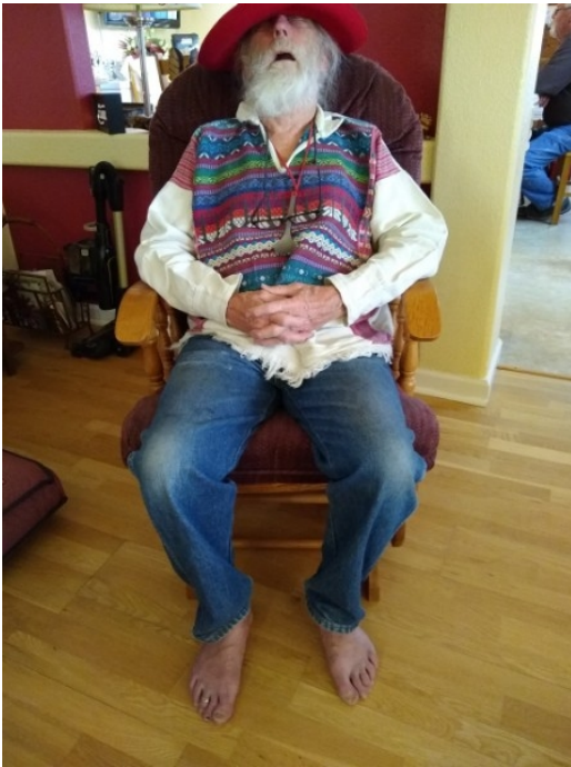
Tryptophan Side Effects