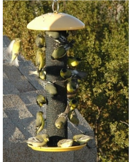
Winter Migration of gold finches has arrived

Read the rest of these storeys and see more pictures at: http://thecatdragdinn.org/ajo19a.html , http://thecatdragdinn.org/ajo19b.html , http://thecatdragdinn.org/ajo19c.html , and http://thecatdragdinn.org/ajo19d.html , tho this last letter is still being composed or may not yet be posted.