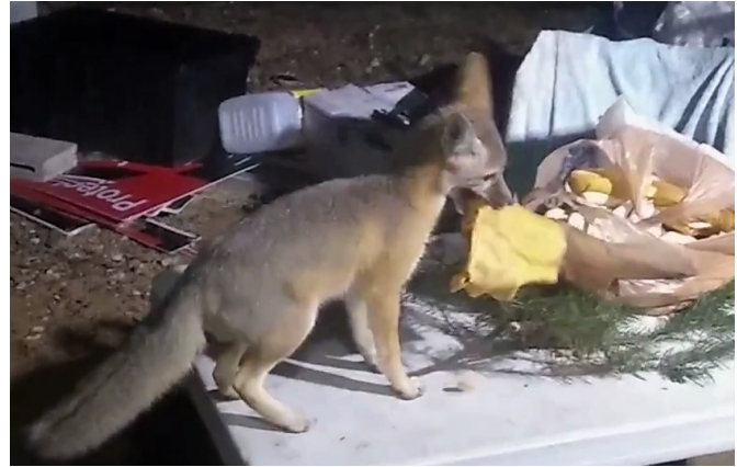
The Fox Came for Lunch