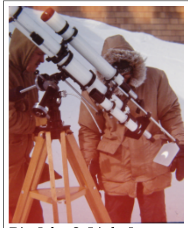
Big John & Little Jon

https://eclipse.gsfc.nasa.gov/SEmap/SEmapNA/TSENorAm1951.gif https://en.wikipedia.org/wiki/Solar eclipse of March 7, 1970 https://eclipse.gsfc.nasa.gov/SEatlas/SEatlas2/SEatlas1961.GIF