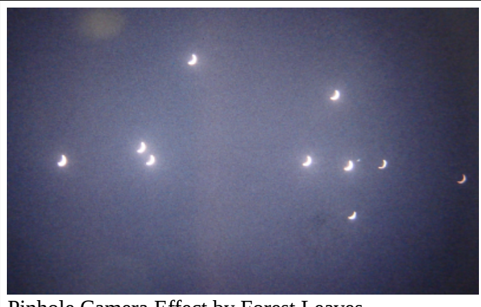
Pinhole Camera Effect by Forest Leaves

We were a day early and set about using Scoutcraft skills to make a table and a washstand. A big school bus came along side and disgorged a flock of hippies. They lowered a drawbridge where the emergency door was and a motorcycle roared out with water jugs strapped to its sides. It roared back later, full, and I knew somewhere inside me that I would someday live in a bus. Our table was well made and seated us all together for a supper of kabobs and cobbler. The field was cold and dew wet that night and the sky brilliant with stars. I know I was not the only one among us