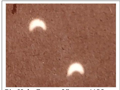
Pin Hole Camera View at 1120

No. Not so. Every eclipse is different. I wrote that "...seen 'em all..." to ameliorate my angst and anguish over missing a more direct involvement this time. The place, the weather, the people you are with, the others you are surrounded by, all those factors contribute to the uniqueness of each eclipse. To help make this eclipse unique I did some different viewing. The pinhole, watching totality six times over on the telly courtesy of NASA, observing the variation of solar insolation on the solar PV array... all those things helped. But still, nothing beats being there.